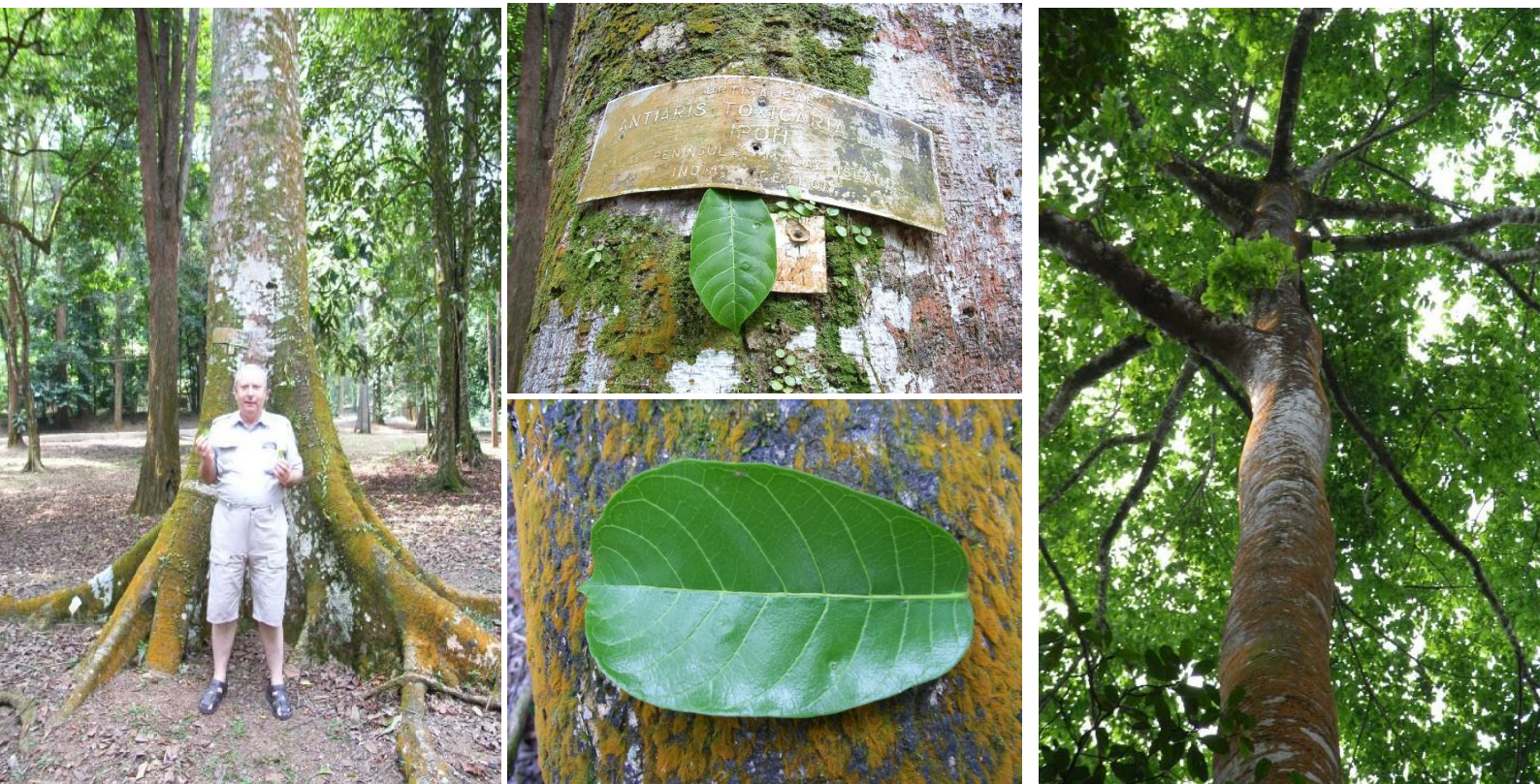
(a) (b) (c) (d)

Fig. #F1abc: Photographs which illustrate most important details of the appearance of the famous Ipoh tree. It is from soap of this tree that the deadly poison "curare" is produced. But this tree is NOT so popular in tropical jungles. In order to find it one needs to put a lot of effort and searches. The above specie I found and photographed in a kind of well kept park which guaranteed a perfect visibility of it, thus also good conditions for photographing. The park is located in the "Forest Research Institute Malaysia (FRIM)", 52109 Kepong, Selangor Darul Ehsan, Malaysia; frim.gov.my . (Click on a given photograph to see it enlarged.)