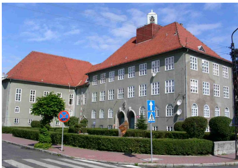
Fig. #D2: The Lyceum of General Education No 1 in Milicz. It is this lyceum that I (i.e. Dr Eng. Jan Pajak) had the honour to attend and finish.

(This illustration is a repetition of the illustration "Fig. #30" from the web page about the town of Milicz .) The majority of German "soldiers" that confronted in Milicz the attacking Red Army, were juvenile pupils of the initial classes of that particular lyceum. They were juvenile, inexperienced, and badly prepared to the battle. In turn their thoughtless leader choose the position for the battle which