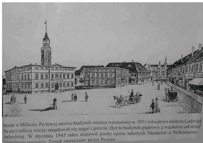
Fig. #D1: The appearance of the town-hall from Milicz, build in 1851.

shown in photographs from "Fig. #D1" of this web page (which is the repetition of the photograph "Fig. #28" from web page about the town of Milicz .) Unfortunately, this town-hall was destroyed during the liberation of Milicz by the Red Army.