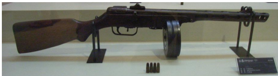
Fig. #E2: The machine gun of the Russian army PPSh-41 from times of the Second World War. It was known under a popular name "pepesha". It was just from such a "pepesha" that were executed the young "defenders of Milicz" in German military uniforms, which in 1945 barricaded themselves in the townhall

In spite of natural for Germans technical genius, in the Second World War the quality of personal weapons of Germans was decisively inferior in comparison to the quality of Russian personal weapons. For example, Germans tried to win the war with the help of a hand reloaded, single shot rifles which were designed almost a half of century earlier! But it turned out that such rifles were useful only in shooting to unarmed prisoners. However, when confronting Russian soldiers armed with excellent "pepesha" machine guns, this single shot rifles gave almost no chances to Germans to survive these confrontations.