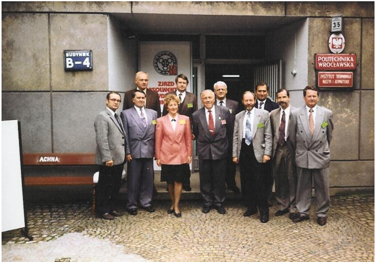
Photograph 2. Participants of the second reunion of graduates of the year 1970 from the Mechanical Engineering Department, Technical University of Wrocław, Poland.

Here is the list of persons present on this photograph: