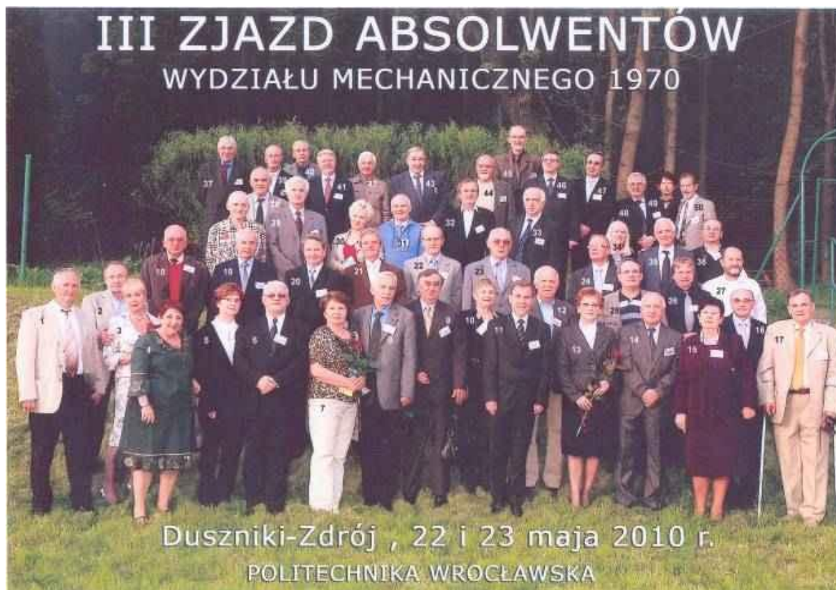
Photograph 3. The group photograph of participants of 3rd reunion of graduates from the year 1970 of the Mechanical Engineering Department, Technical University of Wrocław, Poland. It took place in Duszniki-Zdrój, Poland, on 22 and 23 May 2010.

Possible comments and corrections can be send at the email address agk13@onet.pl