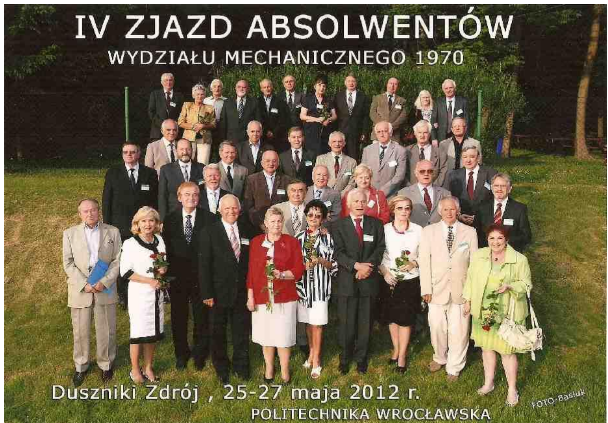
Picture 5. Collective photograph of participants of IV Reunion 1970 year graduates from the Department of Mechanical Engineering at the Technical University of Wrocław, Poland. Duszniki-Zdrój 25 to 27 May 2012.